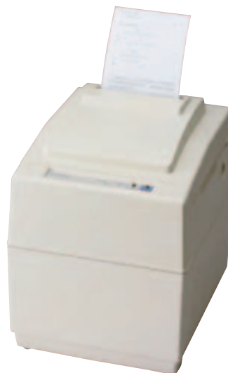
iDP3551F (Auto cutter type)