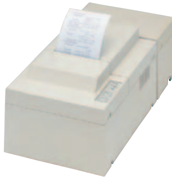
CBM-720+AW-2 (with winder)